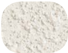
Aspen White II

The exterior face of the TextureWall system features the Texture-Cote™ finish system—a hard aggregate-fiber-reinforced polymer finish that creates its characteristic stucco appearance. The metal interior face is finished in an attractive, virtually flat finish with a polyester white color that is USDA approved. This can act as a finished interior wall or can be used for the application of other wall materials.